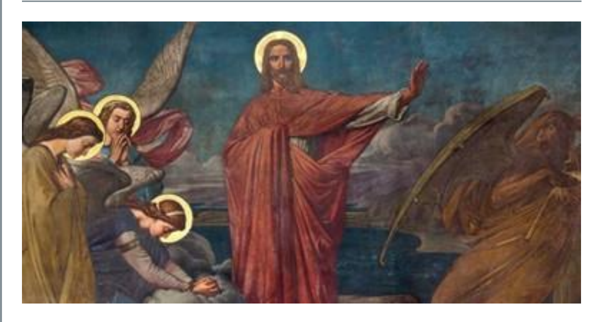
Sunday Morning Worship: